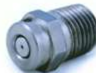
Straight Jet Nozzle