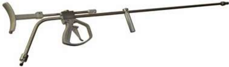
Dump Gun – Max. Pressure Up to 1400 Bar

Here, accessories means items which are used to assemble a complete or partial pumping high pressure system which may be used for high pressure water jetting, hydro blasting, hydrostatic test, surface preparation, sewer jetting, tube cleaning, pipe cleaning, pressure washing, fogging, misting, cooling, high pressure injection, high pressure feeding and many other applications.