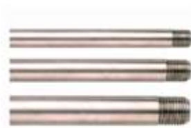
Rigid Tube Lance