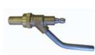
Sand Blasting Attachment