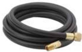
High Pressure Hose