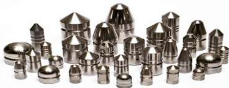
Pipe & Tube Cleaning Nozzles