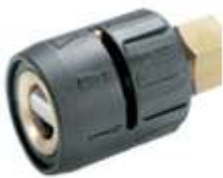
Variable Spray Nozzle