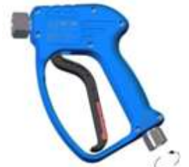
Trigger Operated Gun